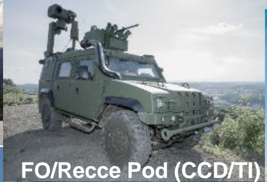
FO/Recce Pod (CCD/TI)