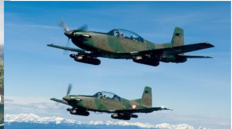
KIOWA and PC-7